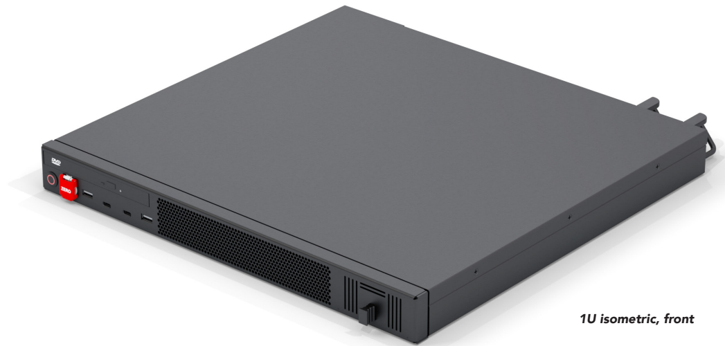
1U isometric, front

GENERAL MICRO SYSTEMS, INC. TRUSTED AND DEPLOYED SINCE 1979