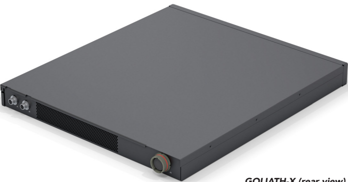
GOLIATH-X (rear view) 1U, isometric, with 38999 connectors