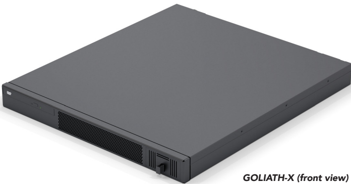
GOLIATH-X (front view) 1U, isometric, with 38999 connectors

Designed for value-conscious rugged applications and built with GMS RuggedDNA™ design methodology, all “Goliath” servers are air-cooled using GMS-proprietary “TwoCool™” fan control. The server uses our proven egg-crate ruggedization technique that stiffens the chassis to provide exceptional shock and vibration for a rackmount server. A 3-year warranty is standard, along with GMS’s made-in-America end-of-life component monitoring and long-lifecycle sustainment policy. Custom versions can be developed with full programmatics and certifications.